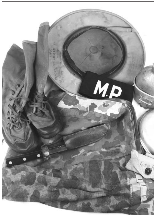
ARTIFACT DONATION FROM THE LYON FAMILY