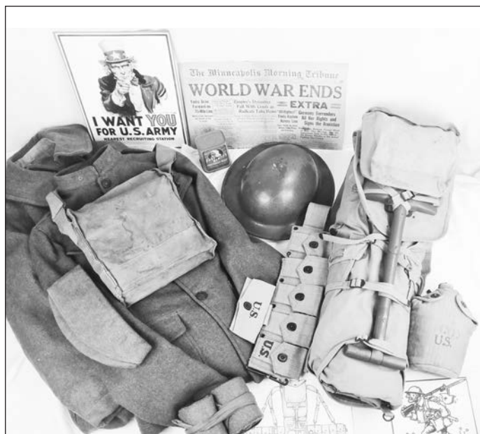
A WORLD WAR I TRAVELING TRUNK

Borrowers can reserve a trunk for three weeks. Arrangements are being worked out with the state's inter-library loan courier system for pick-up and delivery. More information about the program can be found on the museum website under the "Resources" tab.